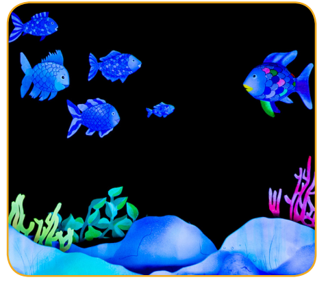
Relaxed Performance Family Workshop at 1 PM

The Very Hungry Caterpillar January 12 at 2 PM