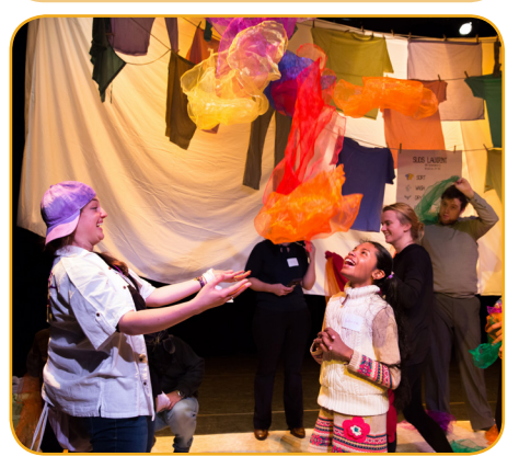
An immersive, multi-sensory theatrical experience for audiences with autism and other developmental differences.